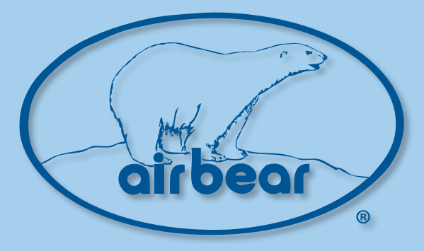
Another True Member of The Air Bear<sup>®</sup> Family