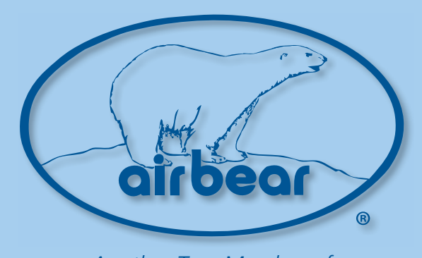
Another True Member of The Air Bear® Family