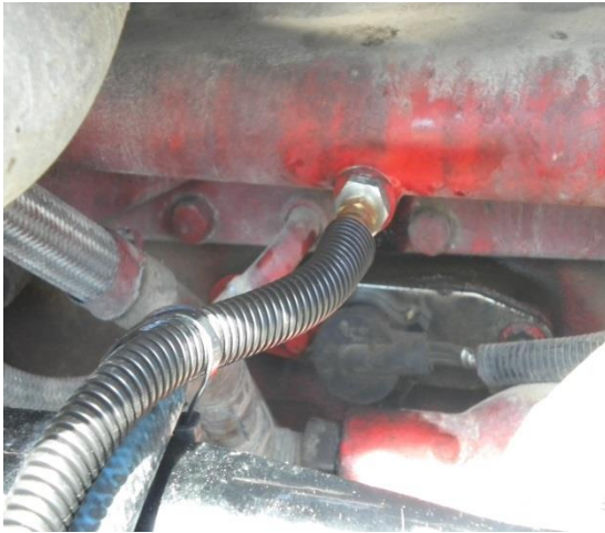
Illustration # 7