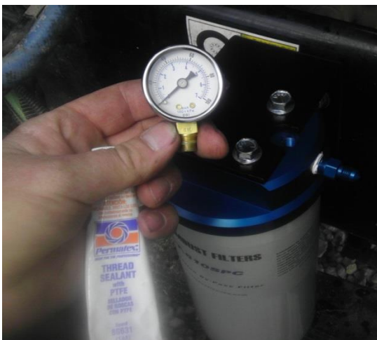
Illustration # 6