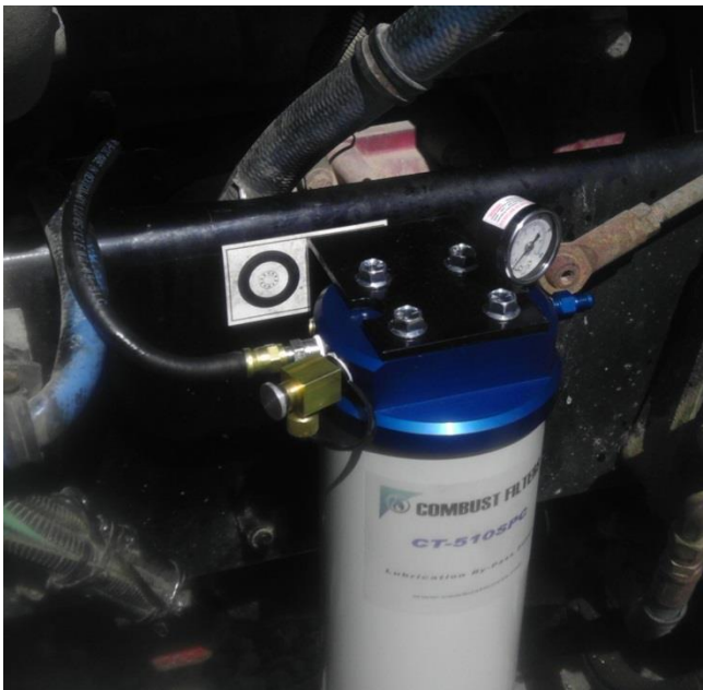
Illustration # 8