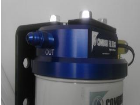
Illustration # 5