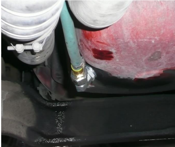
Illustration # 9