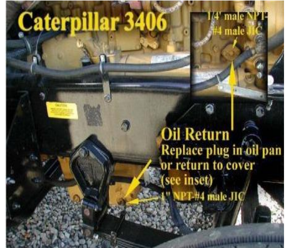
Illustration # 9.1