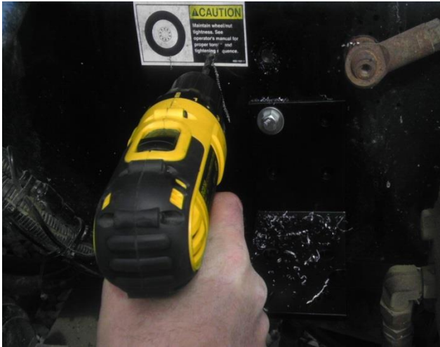
Illustration # 1