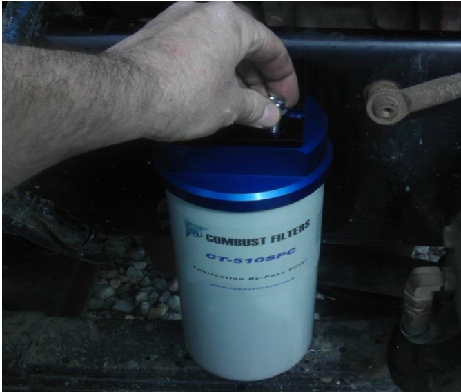
Illustration # 3