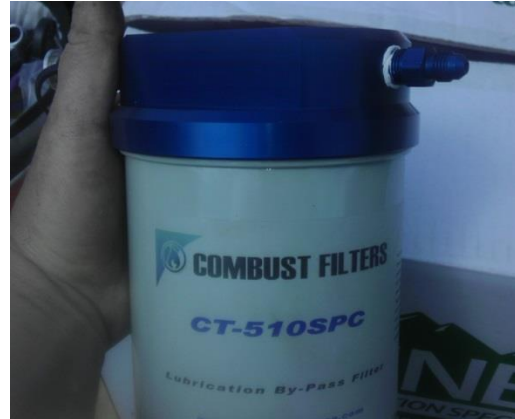
Illustration # 5.1