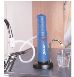
"Plus" add-on kit for connecting to taps at home, in a boat, in a caravan, etc.

For details on spare parts, please contact your Katadyn product dealer.